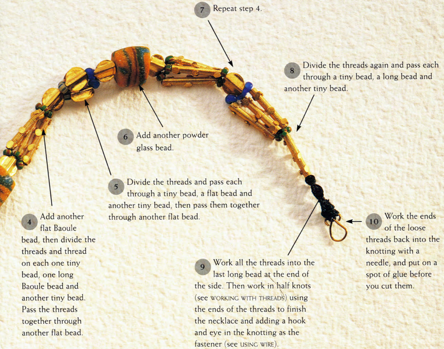
42 FLAT BAOULE BEADS