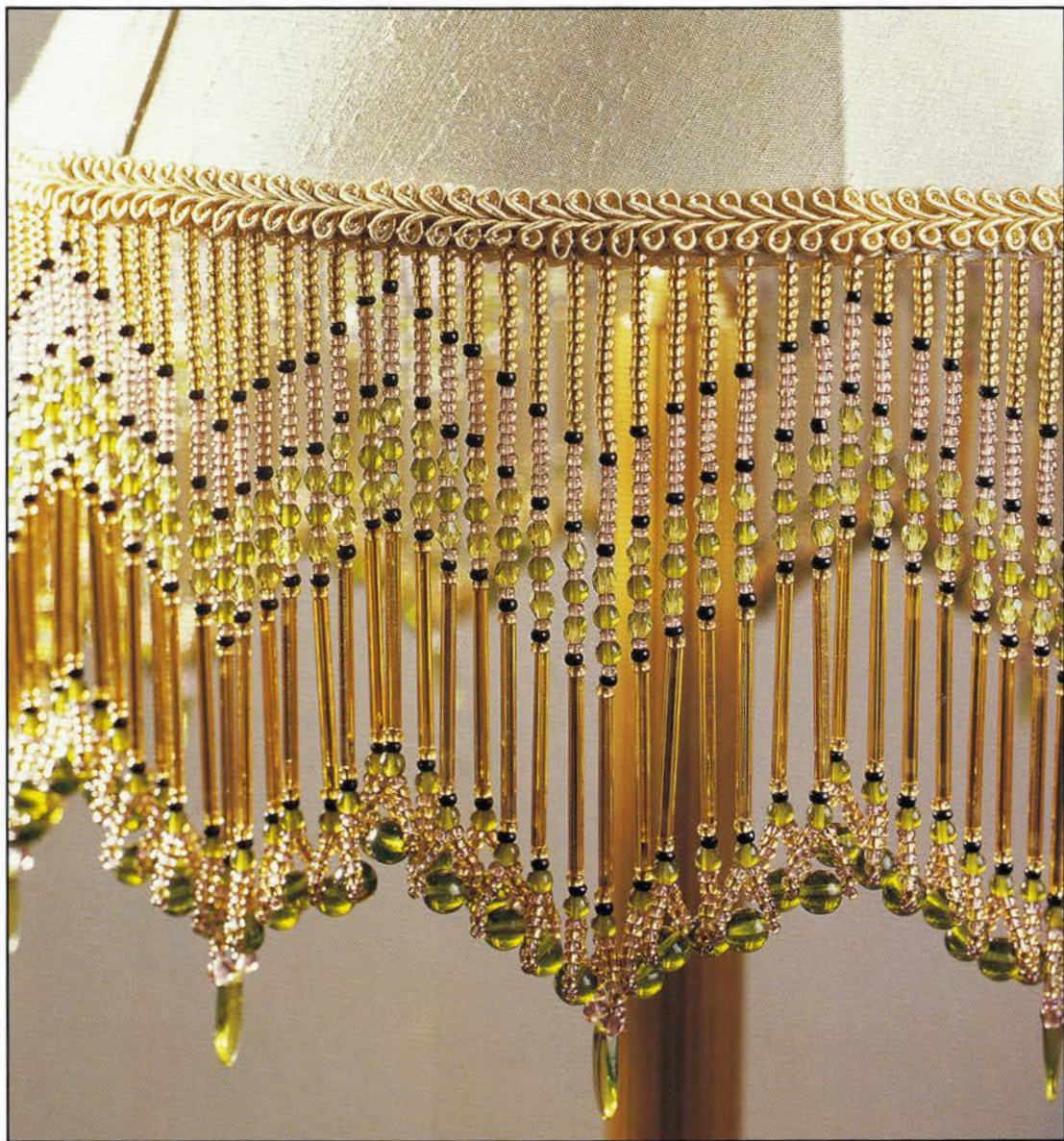
Detail of the Marion Shade