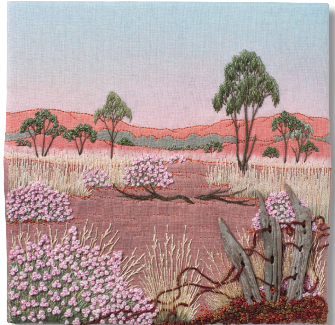
The early morning sky lights up the sand, giving life to Mulla Mulla clumps and desert grasses. Stockyards stand as a monument against glowing dunes. Above: actual size of finished work (approximately 15 x 15 cm/6 x 6 in).