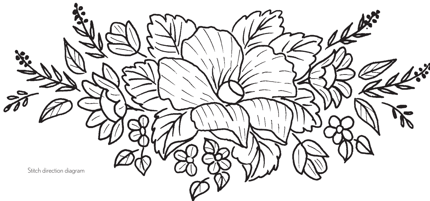
Stitch direction diagram

Outline each leaf with split stitch leaving the centre vein free, using 2 strands D 3013. Fill either side of the leaf with long and short stitch, using 2 strands A 842, D 3013, 3012, 830, 3787. Shade from the outside in towards the centre vein, from light to dark or dark to light. Using one strand 3787, blend in a few straight stitches to add shadow. Work the centre vein in split stitch in one strand 5282.